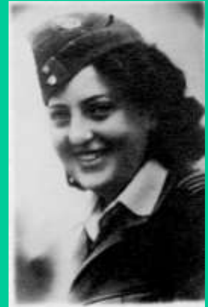
Hannah Szenes July 17, 1921 – November 7, 1944

I gambled on what mattered most, the dice were cast. I lost